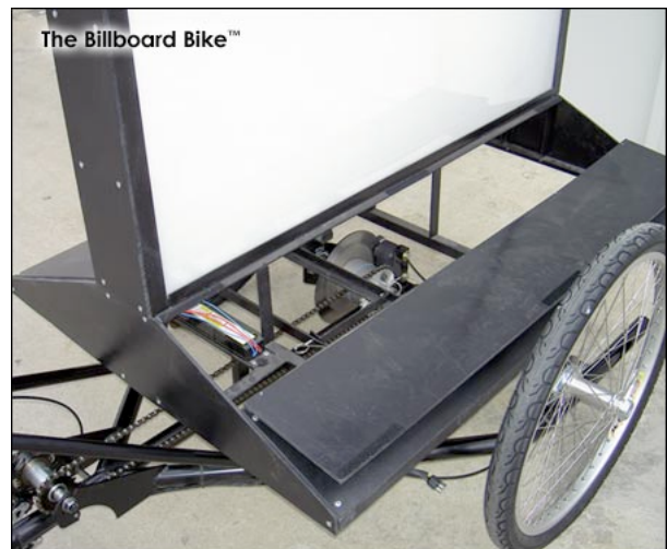
The Billboard Bike™ feature exclusive easy-access door for entry to mechanicals.